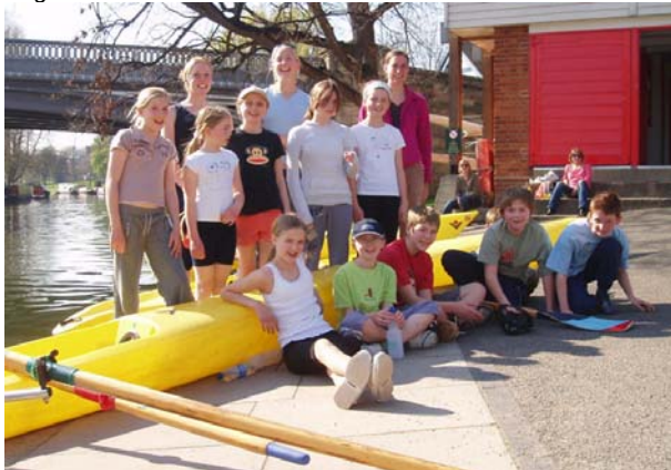
Easter City Sport rowers enjoying the sunshine!

Details of Summer Rowing and Triathlon courses can be found on pg. 4, or on our website at www.cambridgesportlakes.org.uk/news Courses do fill up fast, so please book early to avoid disappointment! •