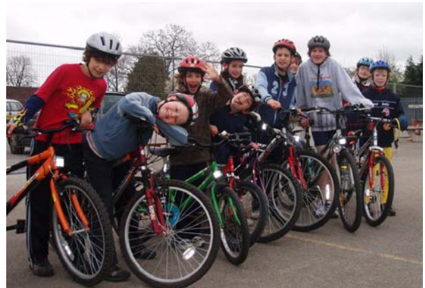
Triathletes at Chesterton City Sport Course, Easter 2007

The beautiful Easter weather saw more than 30 local children participating in Rowing and Triathlon through Cambridge City Council's, City Sport Programme, in partnership with Cambridge Sport Lakes Trust.