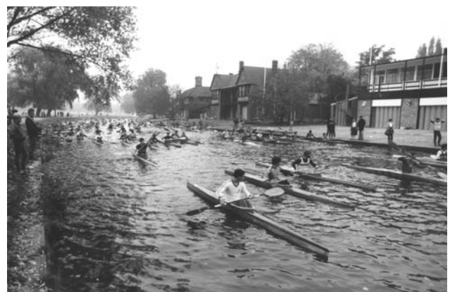
The Cam Marathon race. The picture was taken sometime during the 1980's and shows how many people enjoy coming to race on the River Cam. The race is still held, but the organisers are finding it increasingly difficult to hold with more punts, rowers, fishing and motor cruisers all wanting to use the river.

'It's great to be involved with such a monumental project and to see it develop into a facility for future generations. The country, and region, seems currently to be obsessed with building many thousands of new homes and, in my opinion, without facilities like CSL I feel there would be major shortfalls in encouraging social activity and interaction.'